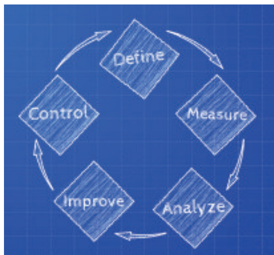
Core methodology: DMAIC

Imagine the power of engaging the whole of the workforce to adopt this mindset. We have uncovered core business processes that are failing because the details of the process are not documented, and the information and standards reside in people's heads and are undocumented.